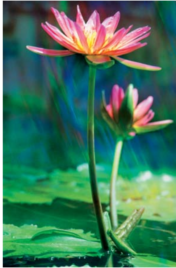
ABOVE, LEFT: "WATER DANCE" CAPTURES A TRIO OF FROLICKING FLAMINGOS, FROM THE BOOK FLORIDA... BEYOND THE BLUE HORIZON ; ABOVE, RIGHT: A WATER LILY AT VERO BEACH WITH SOFT-FOCUS EFFECT; OPPOSITE PAGE: A GREAT EGRET STRIKES A REGAL POSE, DISPLAYING ITS DRAMATIC MATING PLUMAGE IN "THE CALLING"