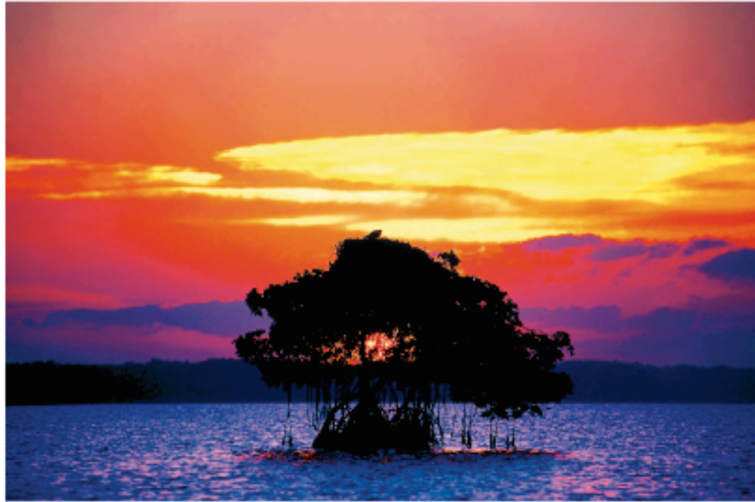
Altar of Light Flamingo