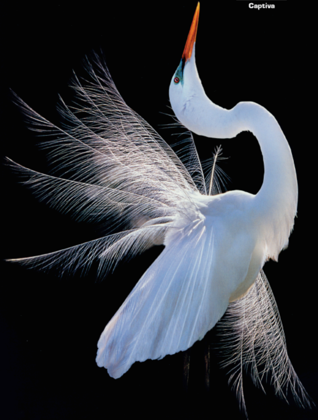
The Calling Captiva