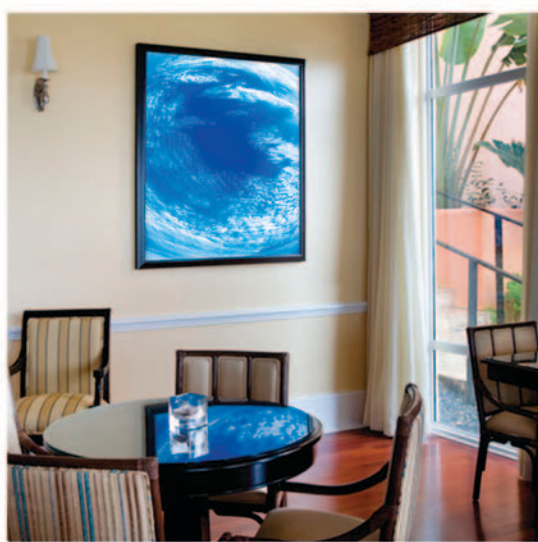
The serene photography of Alan Maltz complements the laidback atmosphere at the Ritz-Carlton on St. Thomas.

The newly-remodeled accommodations feature décor inspired by the Caribbean sand and sea. As a photographer who has spent most of his career shooting Florida's natural beauty, secluded beaches, untouched landscapes and wildlife, Maltz was the ideal candidate for images to match this theme. The majority of the photos chosen for the installation were sunsets, skies and sea captured by Maltz in various tropical locations.