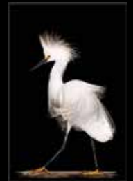
Walk on the Wild Side

PUBLICATIONS - Alan is the author of five award-winning Florida-based coffee table books. These works are offered with quantity discounts and personalized options.