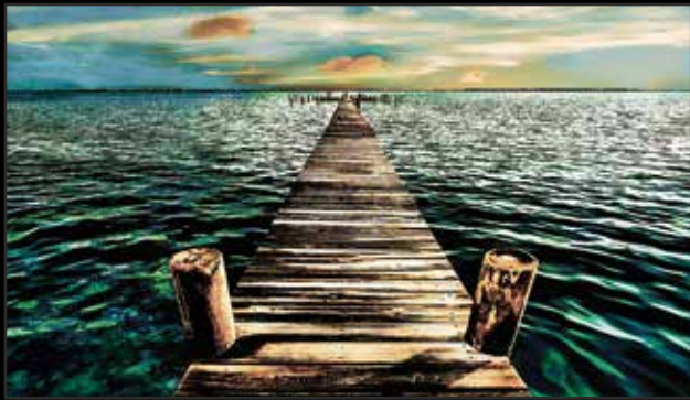
Spiritual Path - Old Florida Collection