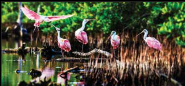
Balance, Beauty & Light