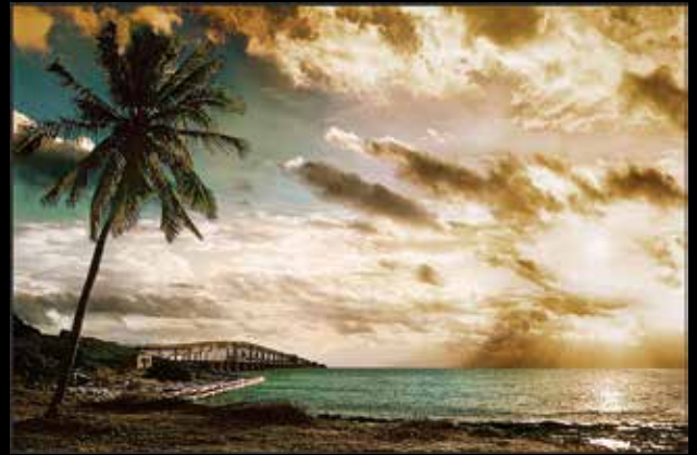
Bahia Honda Sunrise - Old Florida Collection