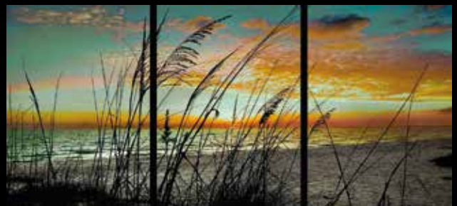
Sea of Dreams - Old Florida Collection (triptych)

For more details, please visit: www.alanmaltz.com/publications .