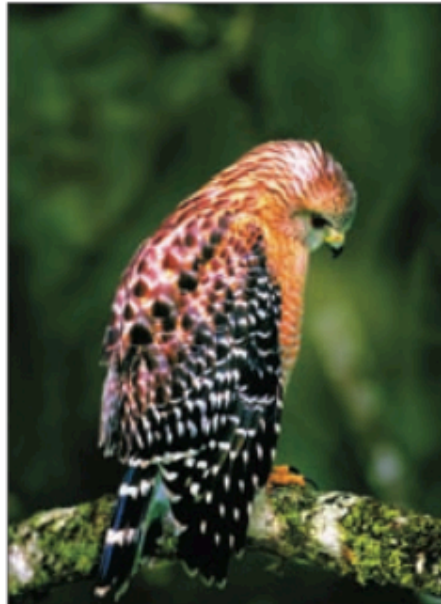
In the Moment