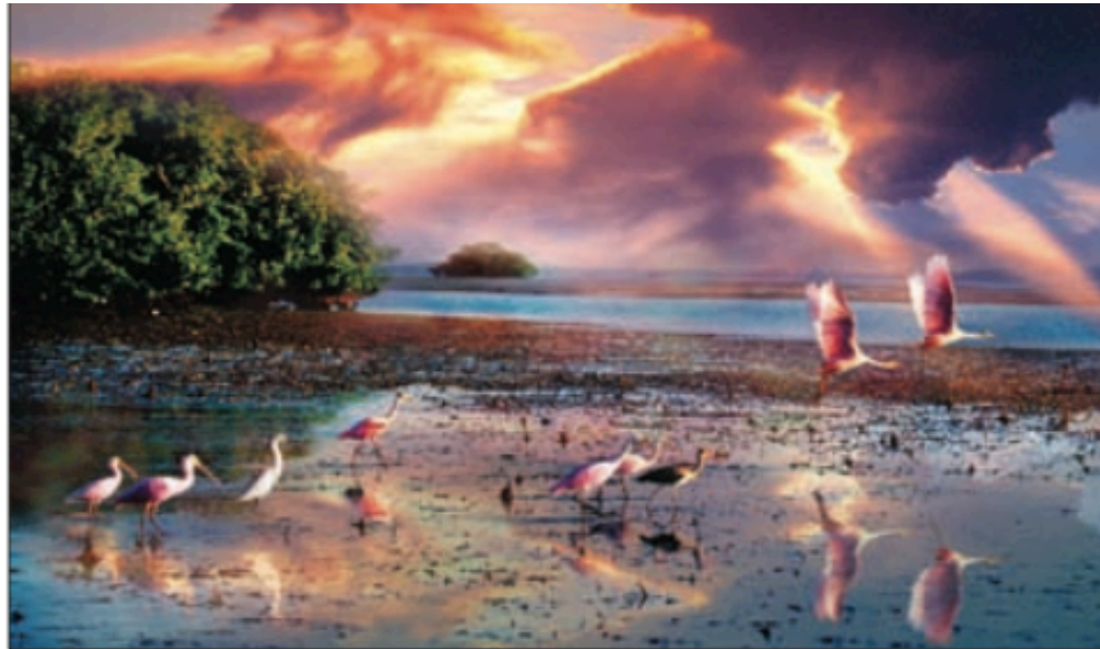
Guiding Light , book cover photo, by Alan S. Maltz